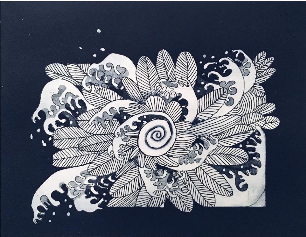
Vicky Tomayko "Sailing the Sea" , etching